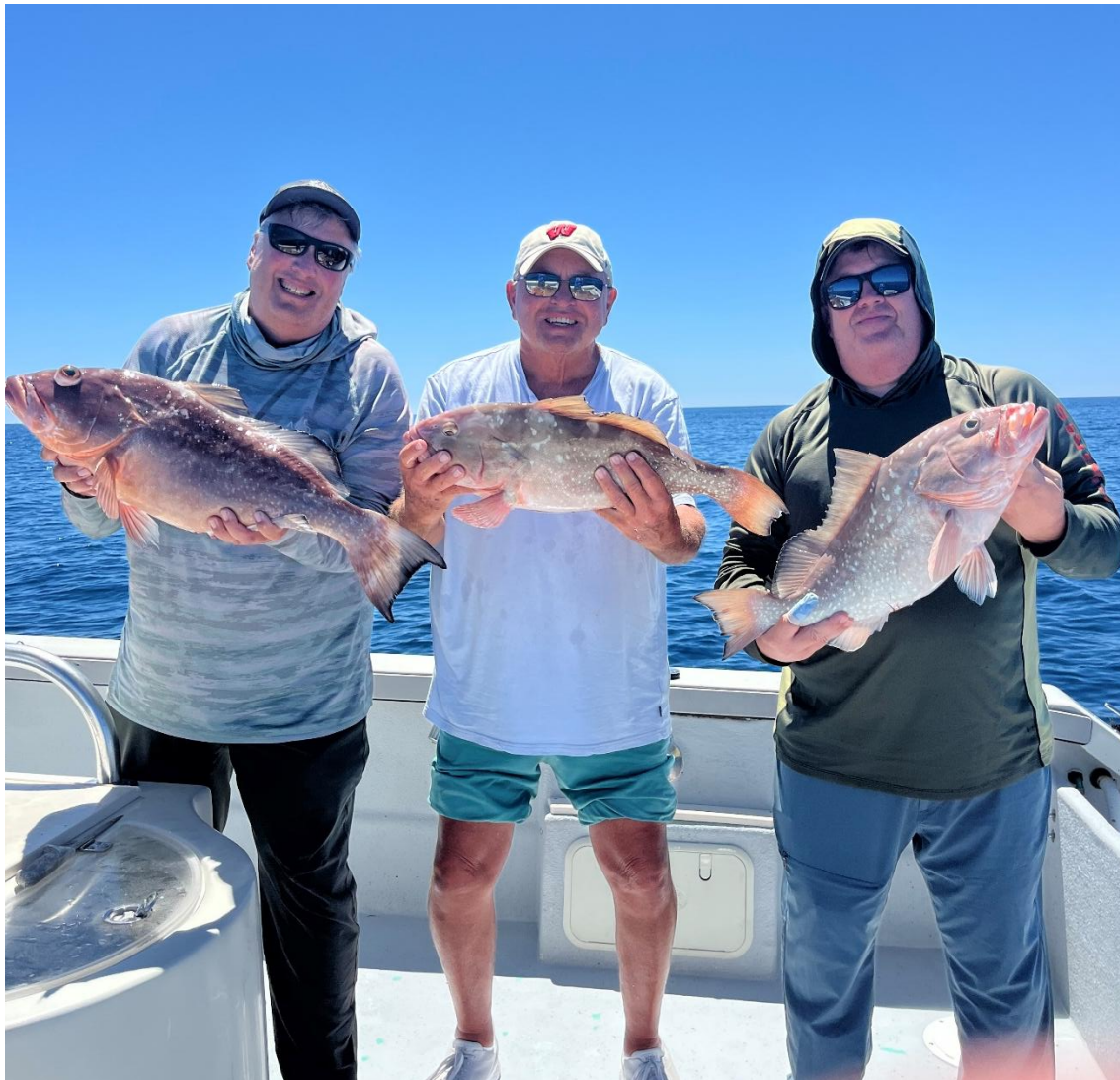
Shamu, Spanky, and Lulu got into Red Grouper 50 miles off Fort Myers Beach